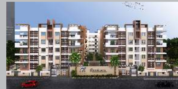
LVS Gardenia (Phase I) Halehalli Village, Kithaghnur & Maragondanahalli Main Road, K R Puram, Bangalore