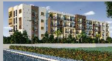
LVS Classic Kithaganur, K R Puram, Bangalore