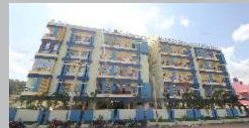
LVS Elegance T C Palya Main Road, K R Puram, Bangalore