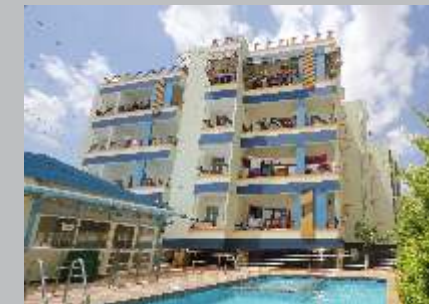
LVS Elite T C Palya Main Road, K R Puram, Bangalore