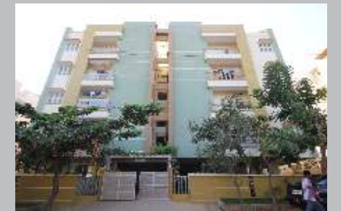
LVS Lavender Behind Manyata Tech Park, Tannisandra, Bangalore