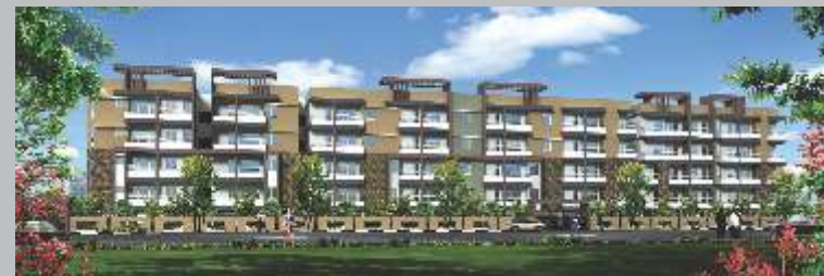
LVS Excellency T C Palya Main Road, K R Puram, Bangalore