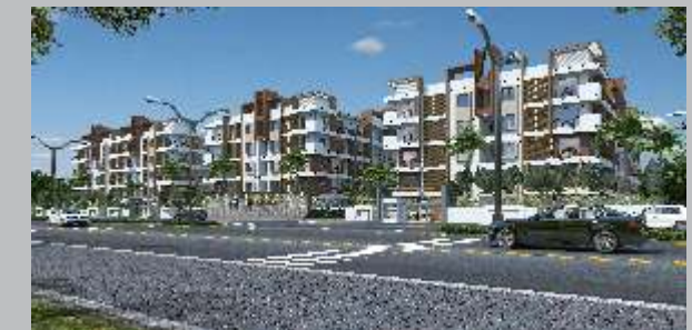
LVS Gardenia (Phase 2) Halehalli Village, Kithaghnur & Maragondanahalli Main Road, K R Puram, Bangalore