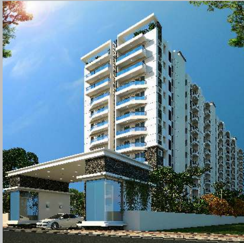
LVS Heights Halehalli Village, Kithaghnur & Maragondanahalli Main Road, K R Puram, Bangalore